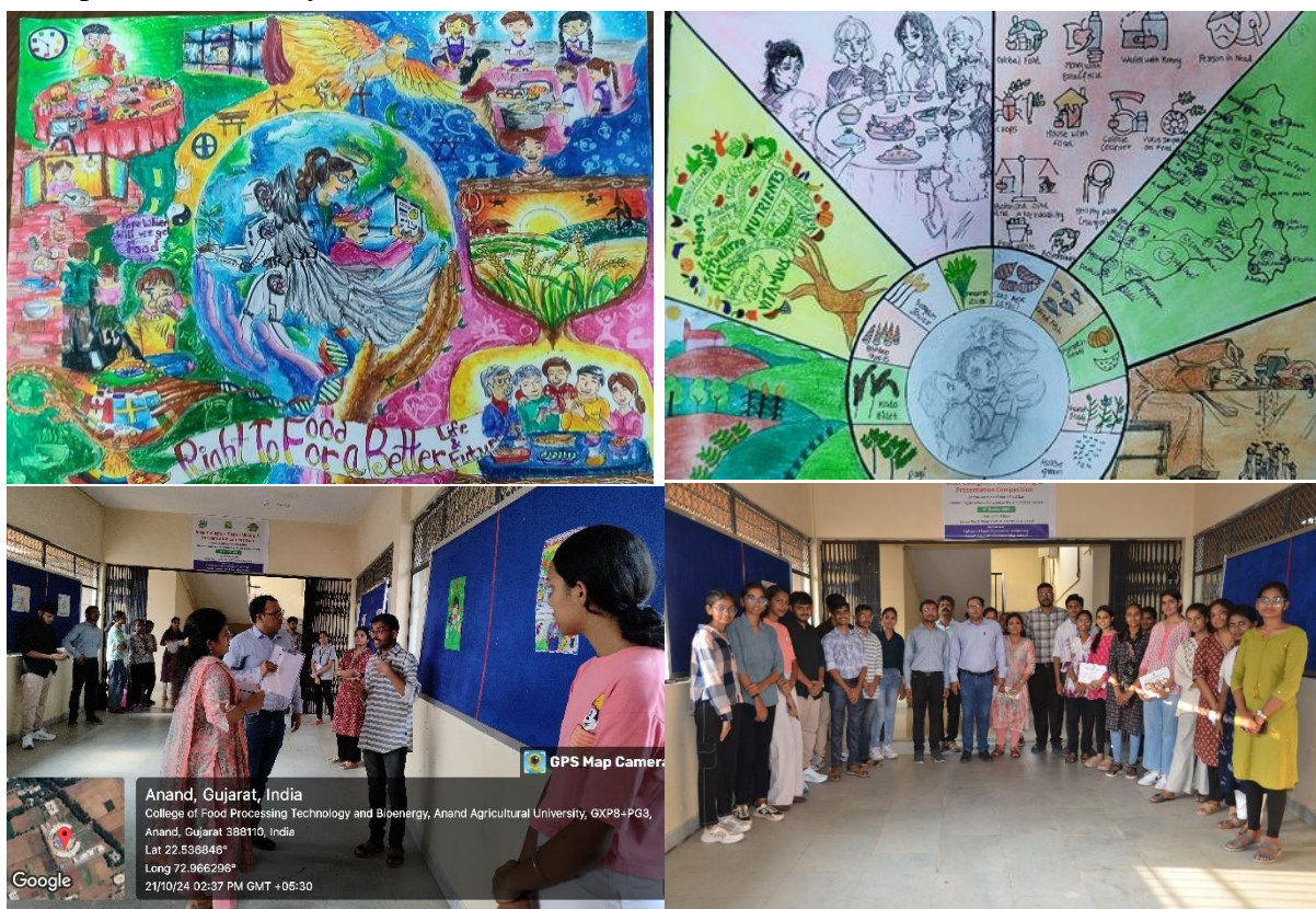
World Food Day Celebration

An Inter-Collegiate Poster Making and Presentation Competition was organized for UG and PG students of AAU at the College of Food Processing Technology & Bioenergy on October 21, 2024, to celebrate World Food Day, which is observed annually on October 16 to commemorate the founding of the United Nations Food and Agriculture Organization. The theme of the competition was 'Right to Food for a Better Life and a Better Future,' aligning with the theme declared by FAO. Twenty students from various colleges of Anand Agricultural University participated in the event, with each student presenting and explaining their poster effectively.