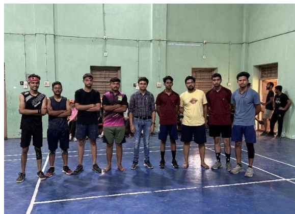
Sports Day Celebration