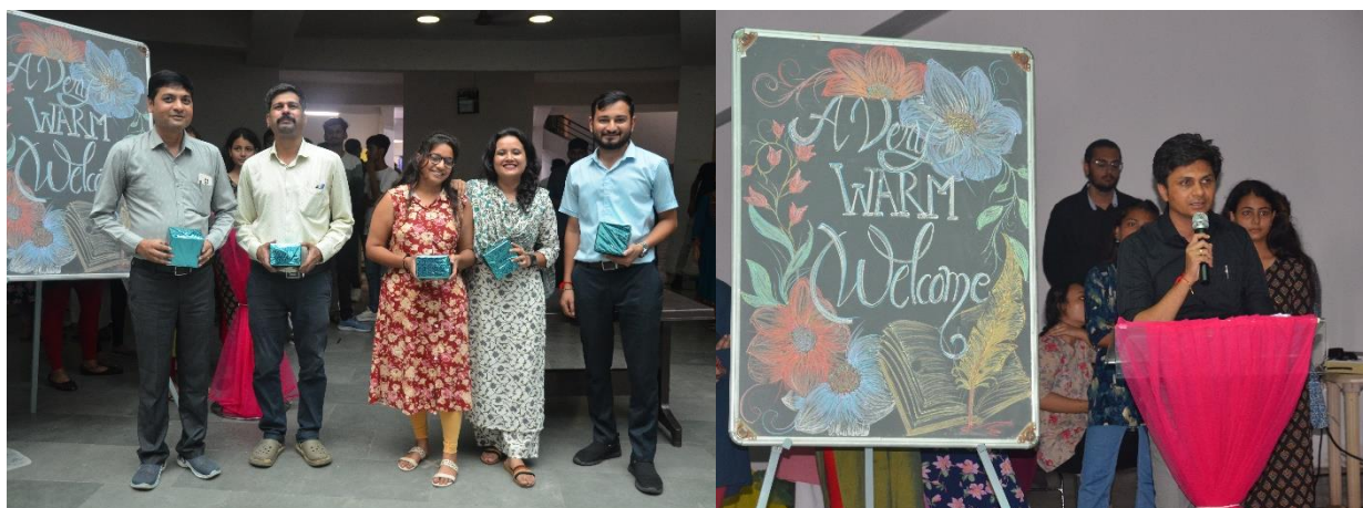
Teachers Day Celebration